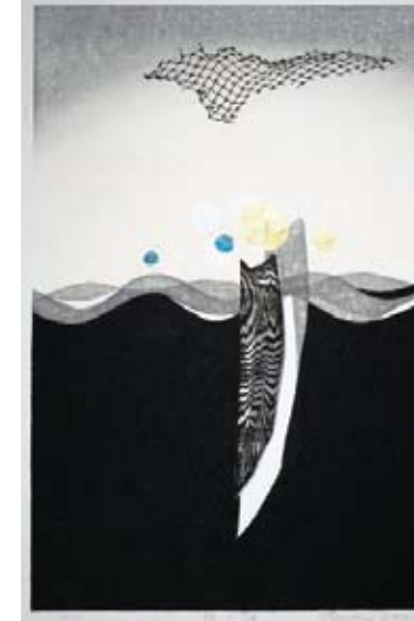
woodcut.